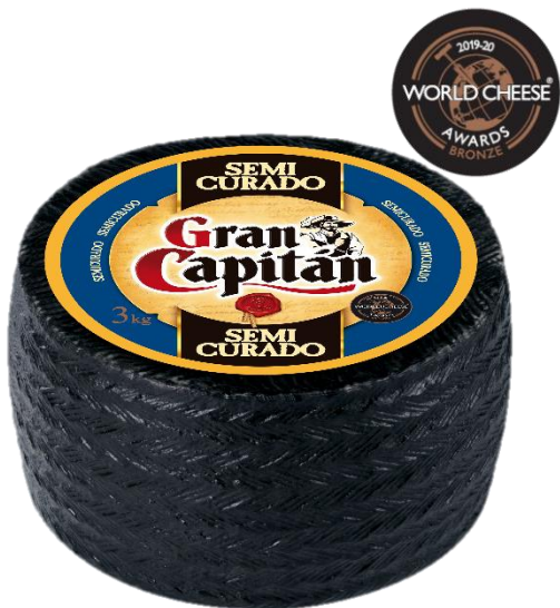
1 SEMICURADO 3 kg wheel