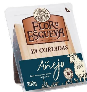
7 AÑEJO 200g precut wedge