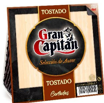
6 TOSTADO 210g cortadas