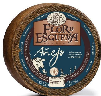
5 AÑEJO 3,2kg wheel