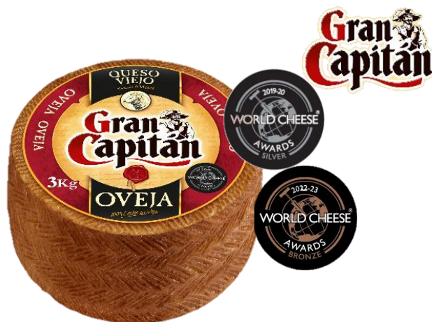
2 VIEJO OVEJA 3 kg wheel