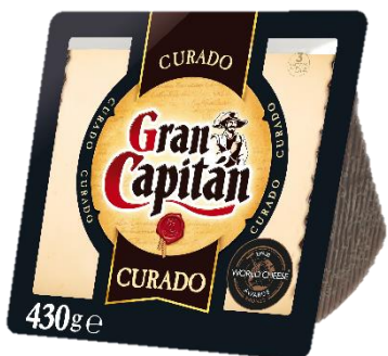
4 CURADO 430g wedge