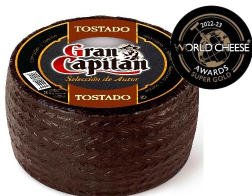
5 TOSTADO 3 kg wheel