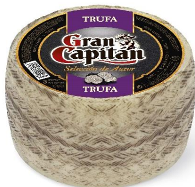
3 TRUFA 3 kg wheel