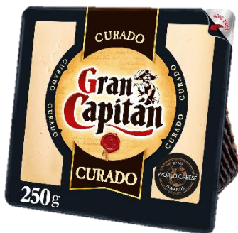
5 CURADO 250g wedge