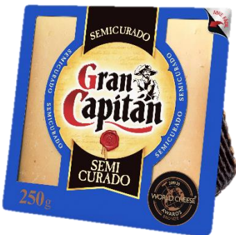
4 SEMICURADO 250g wedge