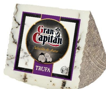
4 TRUFA 200g wedge