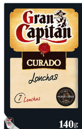
7 CURADO 140g slices