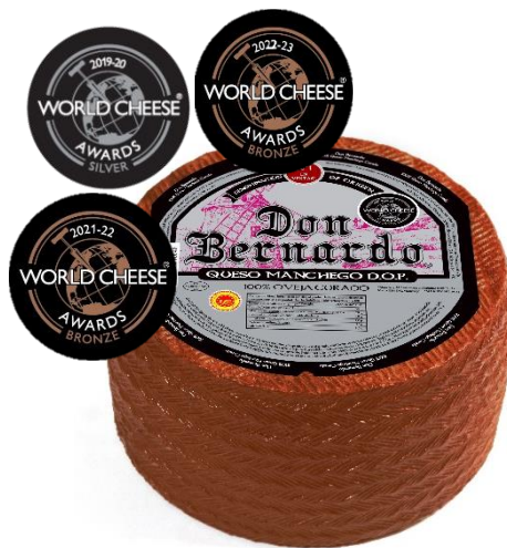
2 CURADO 3 kg wheel