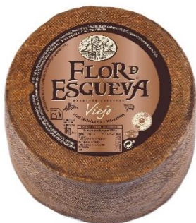
2 VIEJO 1 kg wheel