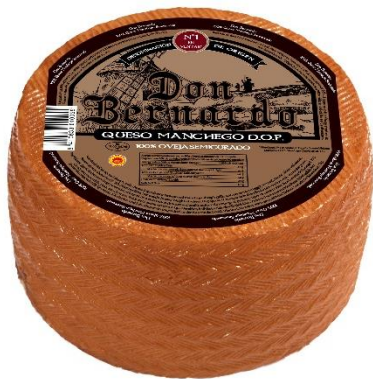
1 SEMICURADO 3 kg wheel