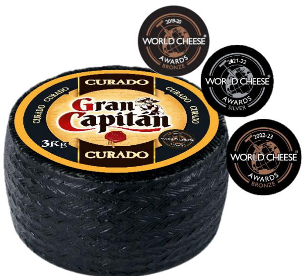
1 CURADO 3 kg wheel