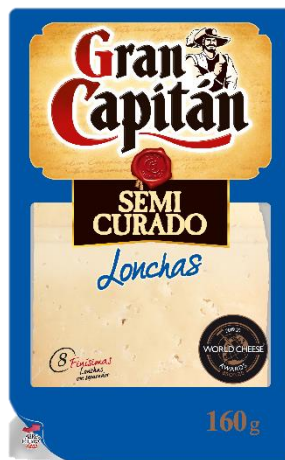
6 SEMICURADO 160g slices