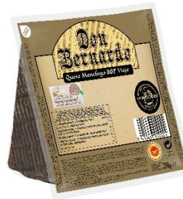
6 VIEJO 250g wedge