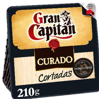
6 CURADO 210g cortadas