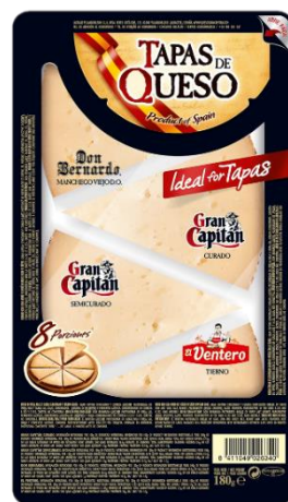
7 TAPAS QUESO 180g