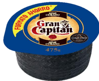
3 SEMICURADO 475g wheel