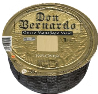
8 VIEJO 880g wheel