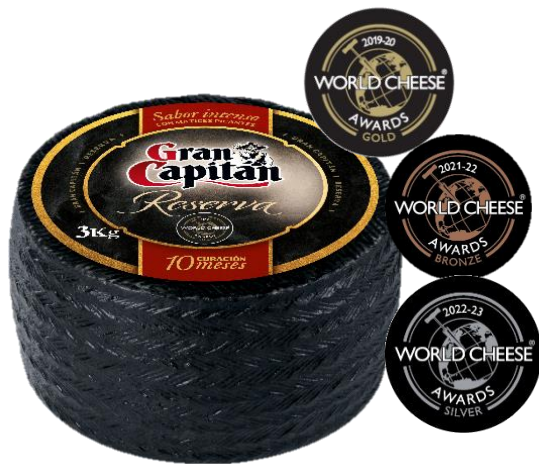
1 RESERVA 3 kg wheel