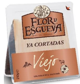
4 VIEJO 210g precut wedge