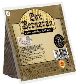
5 VIEJO 200g wedge