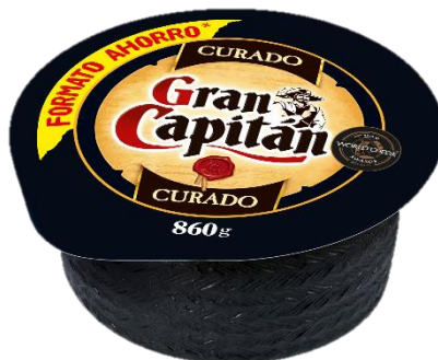
2 CURADO 860g wheel