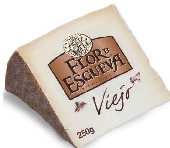
3 VIEJO 250g wedge