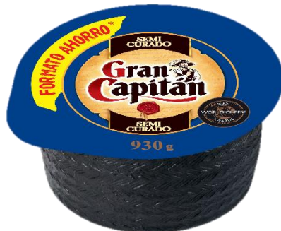
2 SEMICURADO 930g wheel