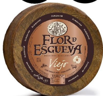
1 VIEJO 3,2 kg wheel