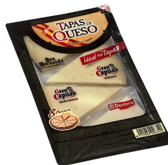
9 TAPAS DE QUESO 180g