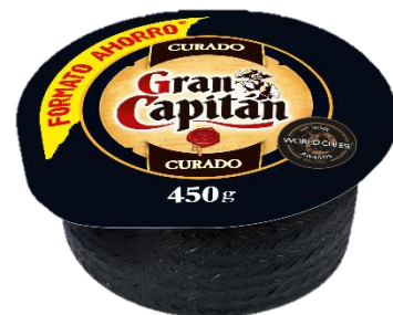
3 CURADO 450g wheel