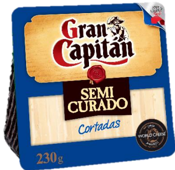
5 SEMICURADO 230g cortadas