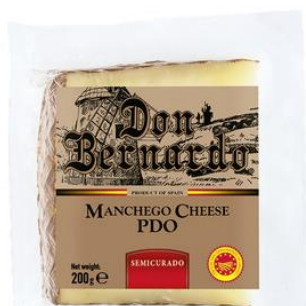
4 SEMICURADO 200g wedge