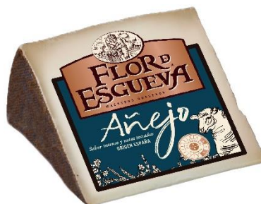
6 AÑEJO 225g wedge