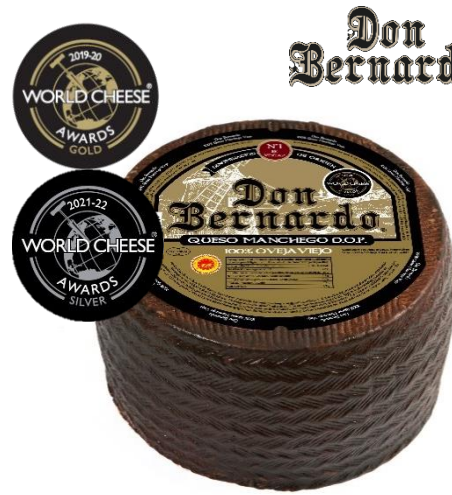
3 VIEJO 3 kg wheel